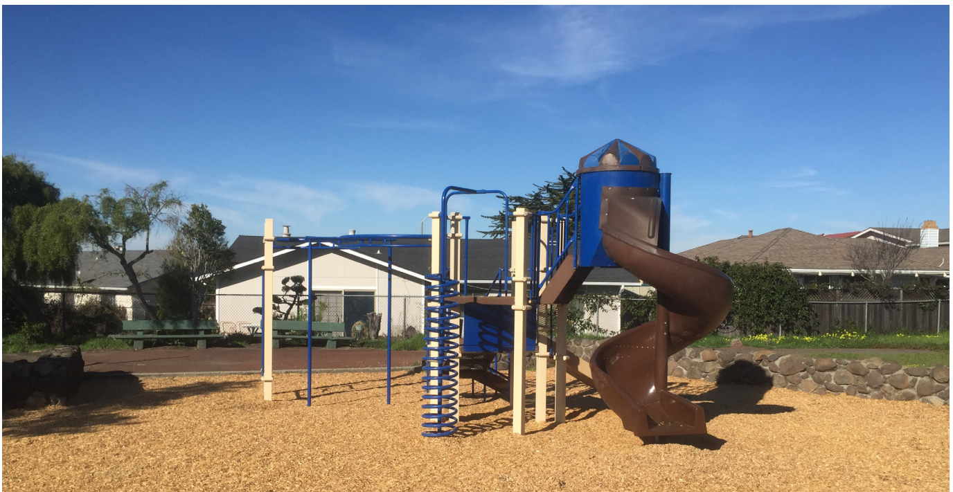
New park equipment in Seaside.

Seaside will continue on its path to create a regional network of active open space trails and bicycle facilities that improve access to the Fort Ord National Monument, Dunes State Park, Seaside beach, open space, and other neighborhood and community parks. Trails will connect to formal and informal trailheads in the National Monument and link to the Fort Ord Rec Trail and Greenway (FORTAG), a regional network of paved recreational trails and greenways connecting communities to open space.