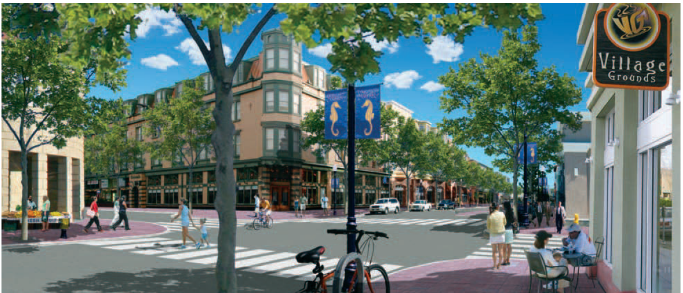
West Broadway Urban Village Specific Plan.

The Seaside Auto Center and auto-related businesses will continue to be a major contributor to Seaside's fiscal health. However, emerging trends in the transportation sector, such as autonomous vehicles, electrification, and shared mobility, may disrupt the automotive industry and affect how auto-related businesses use land in Seaside. If these transformations occur, the City will maintain this area as a vibrant center for employment, supporting a diverse mix of companies, jobs, and makerspaces, while creating more walkable blocks.