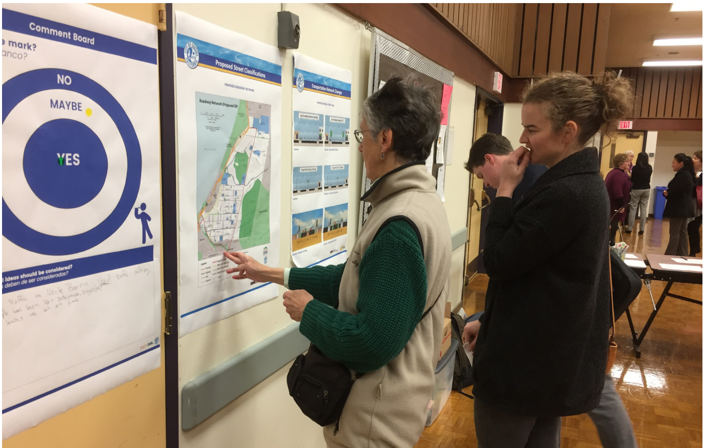
Transportation alternatives at community meeting #4.

Seaside's diverse economy allows prosperity to be shared by all residents. Residents have access to educational and training opportunities to overcome employment barriers. A highly-trained and skilled workforce helps attract new businesses to the City.