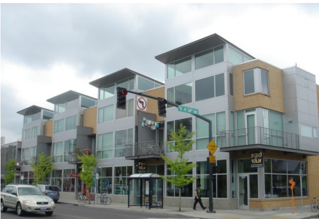
Example of corridor mixed-use development.

Seaside needs a diverse housing inventory to meet the changing needs of the community. Demographic shifts in the last two decades require a range of housing options that can give residents choice and the ability to age in place as their housing needs evolve over time. While Seaside has more affordable housing inventory compared to other communities in the Monterey Peninsula, rising costs have compelled many, especially those with lower incomes, to live in inadequate and overcrowded housing. The City's mixed density neighborhoods adjacent to Fremont Boulevard present an ideal opportunity to expand affordable housing choices, which will benefit many, including young professionals looking to remain or relocate to Seaside, first-time buyers, or seniors looking to downsize, among others. The General Plan promotes a diverse mix of building types and unit sizes, encourages new deed-restricted affordable housing, and incentivizes the renovation or redevelopment of older multifamily buildings.