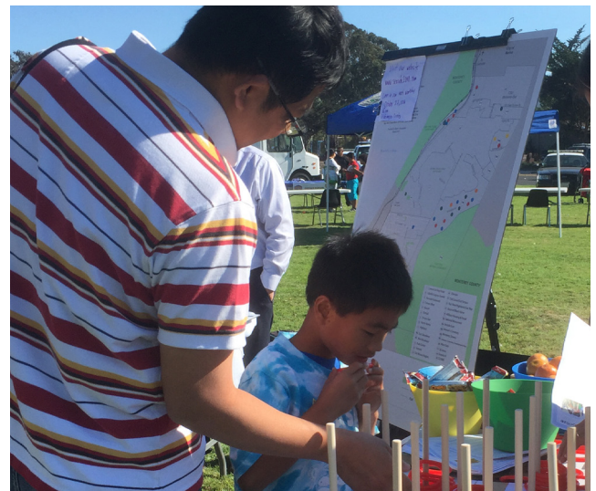
Interactive exercises from community meeting #2.