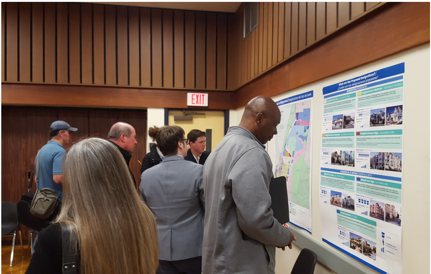
Community meeting #4.

Seaside is a community with thoughtful, planned growth and well-designed neighborhoods that respect and complement the natural environment. A variety of housing, recreational, and economic development opportunities are available that clearly identify Seaside as a destination on the Monterey Peninsula with access to regional-serving employment, CSUMB and the Fort Ord National Monument. A multimodal transportation system supports land uses and mobility for all residents.