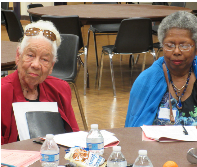
Small group discussion at community meeting #5.

Seaside makes decisions to support the physical and mental health of its residents. The City improves access to healthy food, limits pollution, and increases access to health, mental health, and preventive care services.