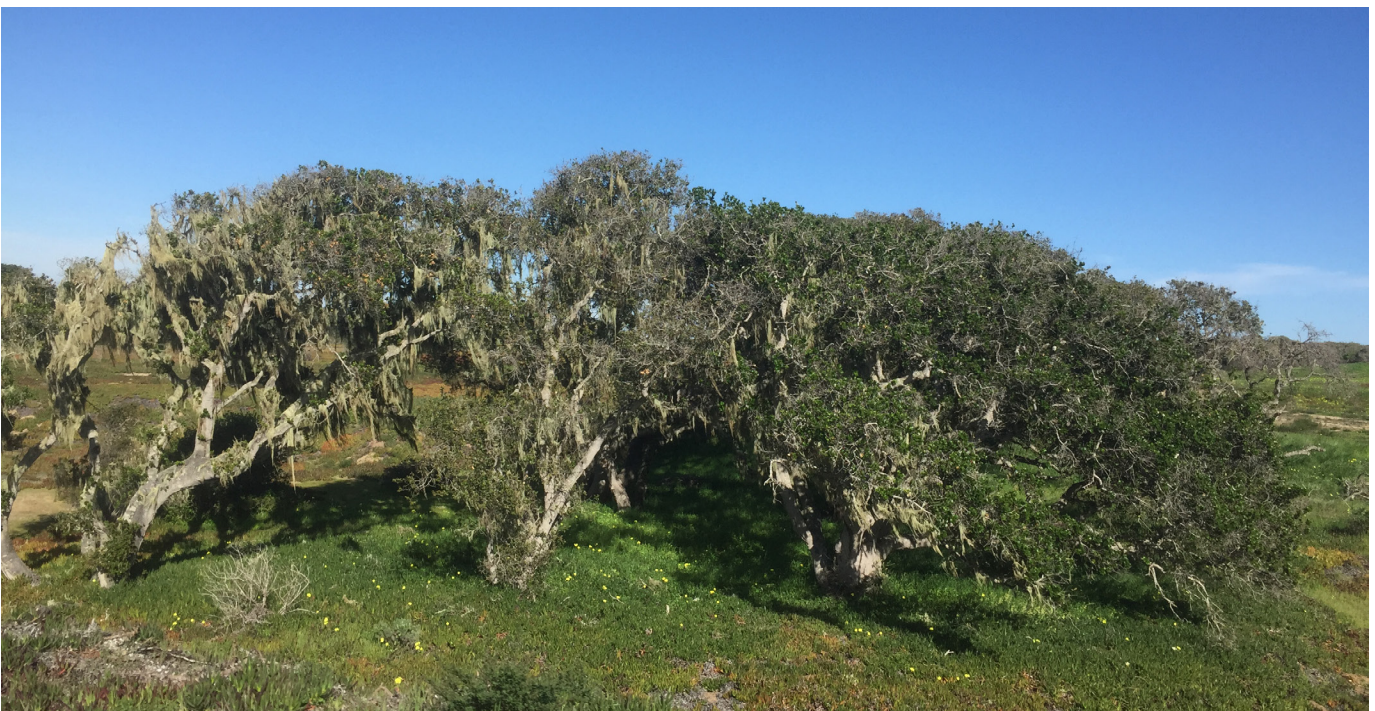
Oak woodlands on former Fort Ord lands.

Seaside faces significant water supply limitations that may affect existing residents and future growth. Developing a strong framework of policies and practices that encourage sustainable water management is a critical step to strengthen the local (and regional) economy. These actions include: promoting water conservation and efficiency in existing buildings, increasing the City’s recycled water supply, optimizing groundwater recharge, and supporting a portfolio of new water sources under development by Cal-Am, MCWD, MRWPCA and MPWMD. Once this occurs, intensification and redevelopment can occur in areas such as Downtown Seaside and Fremont Boulevard.