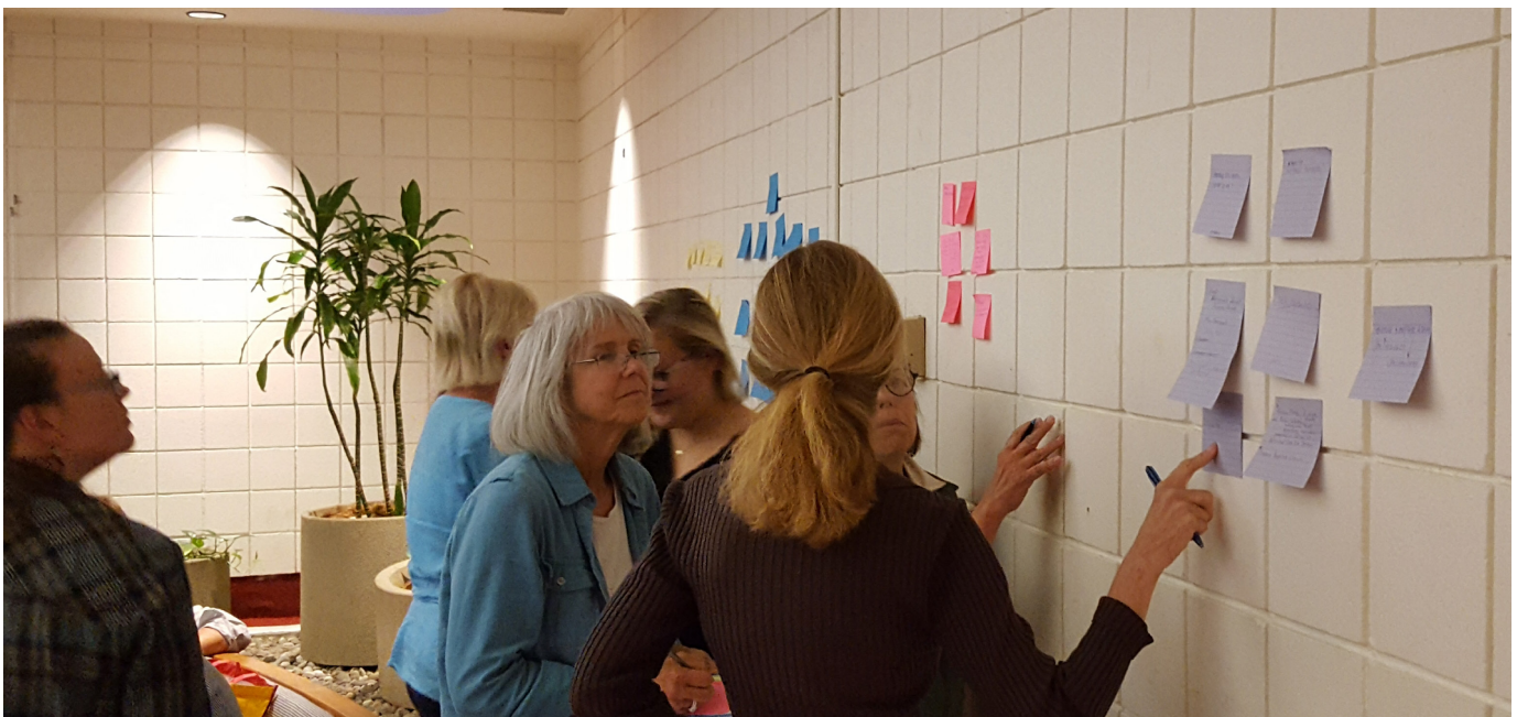
Community engagement in Seaside.

Seaside is a Peninsula leader by actively working towards its vision, monitoring its actions, and adjusting course. Seaside conducts business in an open and transparent way that encourages everyone to participate. The City works with residents and organizations to achieve its vision.